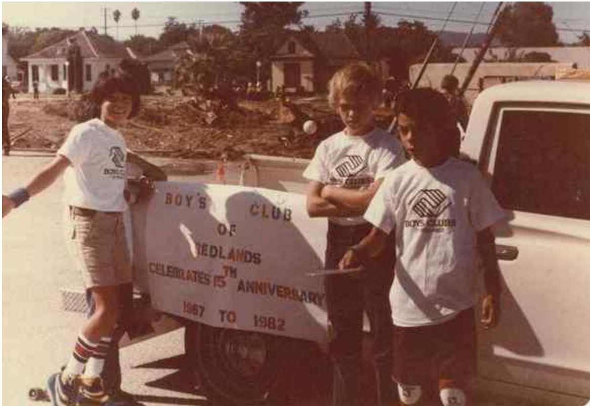
Boys help celebrate the 15th anniversary of the Boys' Club of Redlands, now Boys & Girls Clubs of Greater Redlands-Riverside, in 1982.